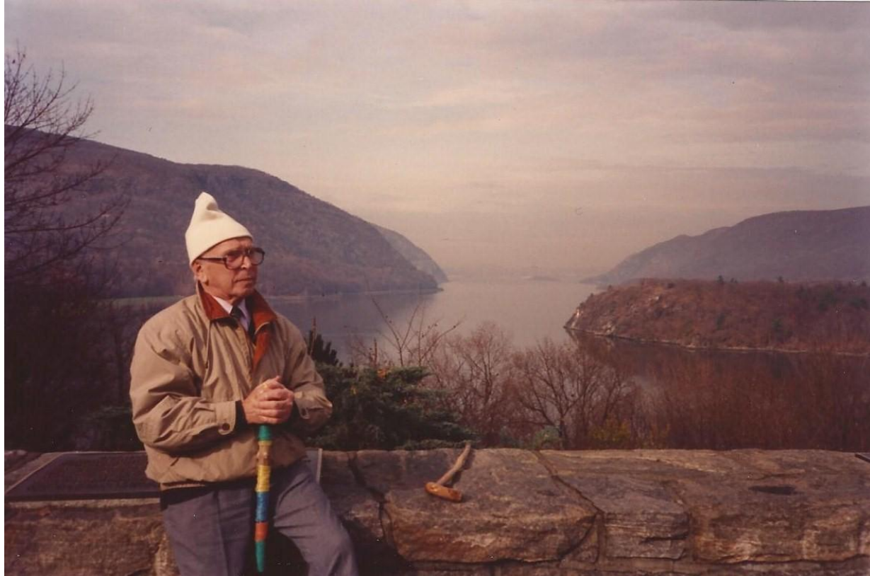
Hudson River, NY