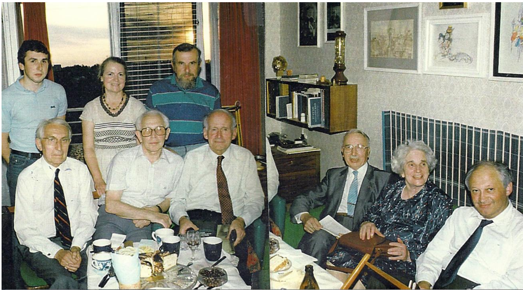
Meeting with French Scientists: A. Gvinier, Ya. Alpert, L. Schwartz, H. Cartan, N. Cartan, S. Alber, L. Brailovsky, S. Alpert, V. Brailovsky, June 1987