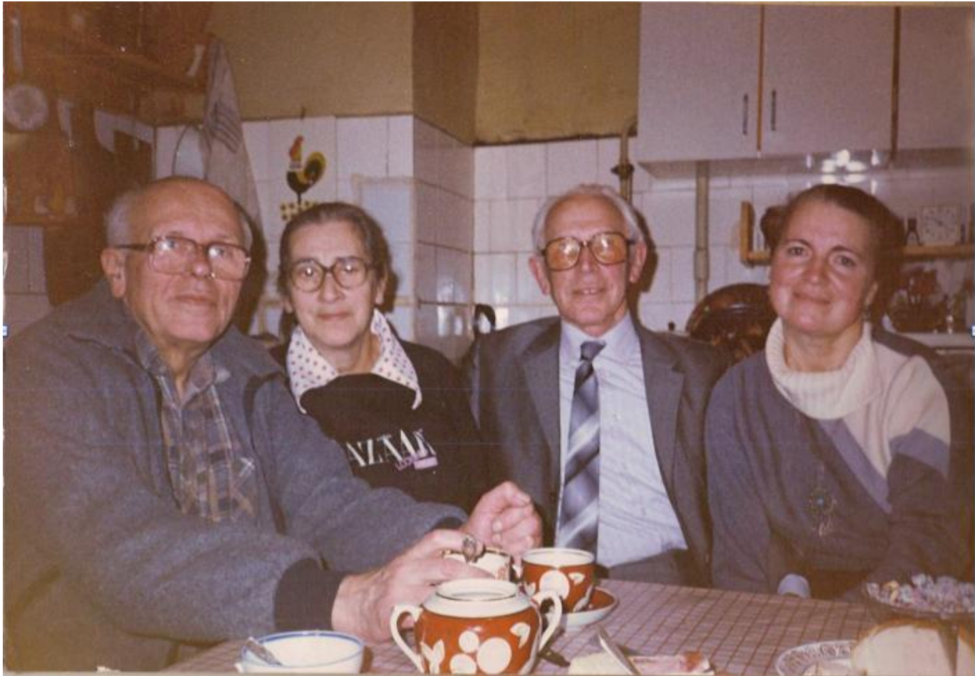
Farewell meeting with A.Sakharov & E.Bonner in their kitchen, December 1987